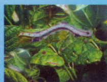
3. Caterpillar damage