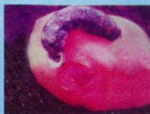
2. Bollworm damage