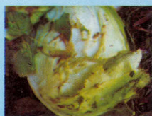
1. Diamond Back Moth (DBM) damage